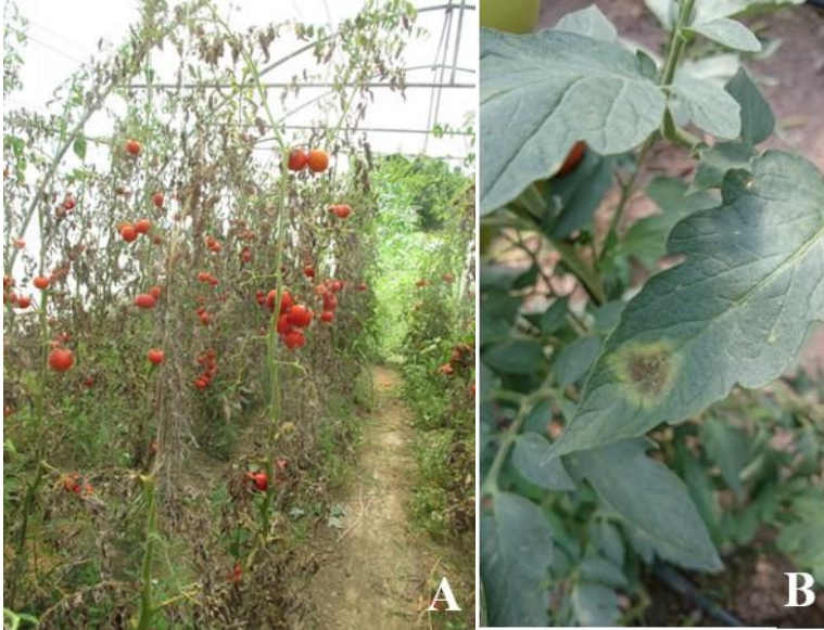
Figure 3. A: Leaves of the tomatoes grown in a high tunnel greenhouse in the Old Hamidiye village of Bartın were completely dry due to leaf mold caused by Passalora fulva . B: Fungal cover on tomato leaf surface observed in Bartın province.